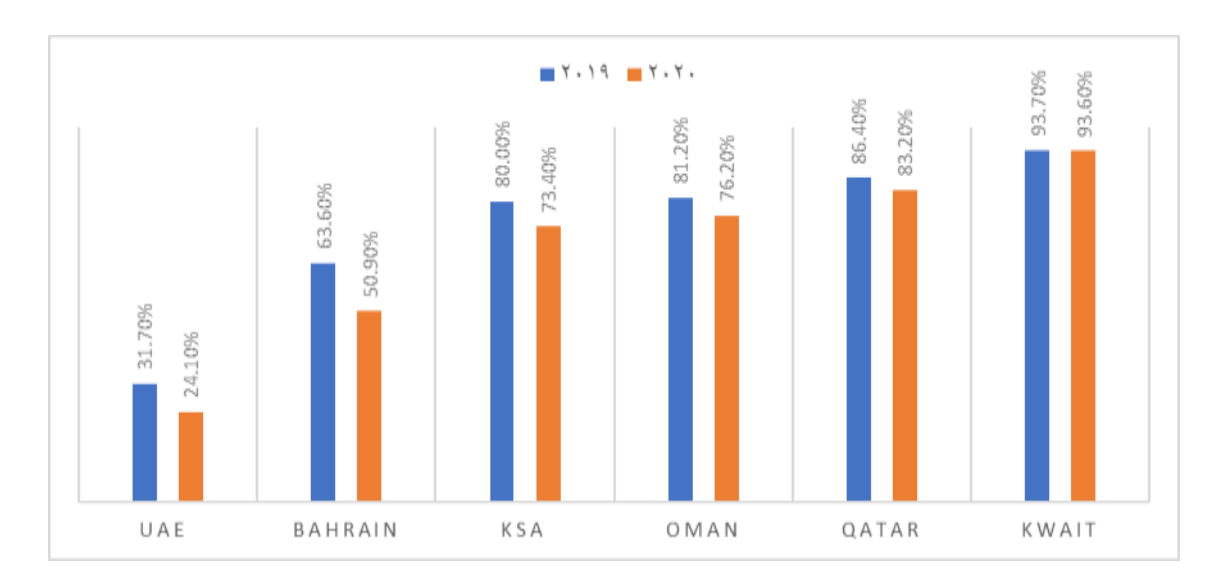
Figure 1. Percentage of Non-Oil Exports from Total Exports in GCC (%).