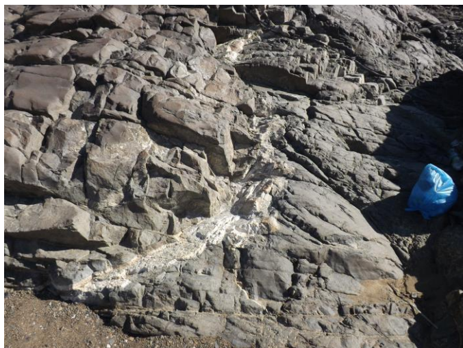
Fig. 3. Gabbro outcrop showing jointing and dyke intrusions

(Fig.4). However, many sills, dykes and localised serpentinisation and chloritisation decrease the potential for dimension stone. At outcrop the gabbro is often massive with a 'speckled appearance' caused by the coarse grain size and the mixing of dark pyroxene crystals and pale coloured plagioclase crystals.