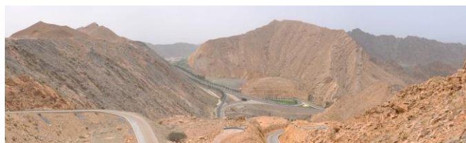
Fig.4. Extensive outcrop of Tertiary limestone

The post-emplacement units of Oman include a late Cretaceous assemblage unconformably resting on the Allochthonous units. The Tertiary limestone is exposed in foothills of Hajar Mountains, and form largest extension of the Dhofar Mountains in southern Oman [3],[4]. The outcrops of individual units are extensive, relatively homogenous and are interbedded with clay, silt and stone, chert (Fig.5) . In general, these rocks are tectonically undisturbed with low dip values and few tight folds. However, they are cut by several major shear zones, adjacent to which closely spaced fractures greatly decrease the potential for dimension stone extraction.