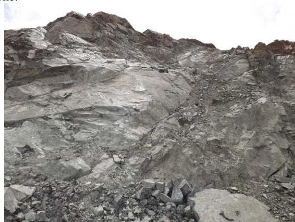
Fig. 2. Outcrop representing serpentinized harzburgite/dunite

Harzburgite has an extensive outcrop that forms steep jagged peaks, and characteristically have a deeply weathered surface layer which can be up to two metres thick (Fig.3). The thickness of the harzburgite is up to several kilometres. Weathering discolours and weakens the rock. The weathered layer would have to be avoided for dimension stone applications. When polished the rock tends to have a dark grey-black homogeneous appearance with anastomosing areas of serpentine alteration. Serpentine carbonate minerals, closely spaced joints and cleavages are common features of the harzburgite. The presence of these features is one of the most inhibiting factors for the use of this lithology as a dimension stone.