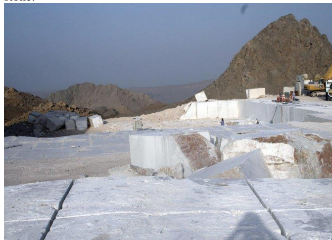
Fig.2. Quarried outcrops of the exotic limestone "marble"

rock (dunite and harzburgite). Structurally, the ophiolite can be divided into areas several tens of kilometres in size that are separated by major shear zones. These shear zones, and other major structural features, are responsible for the intense fracturing, faulting and alteration of these rocks and control the size of blocks that could be extracted for use as dimension stone.